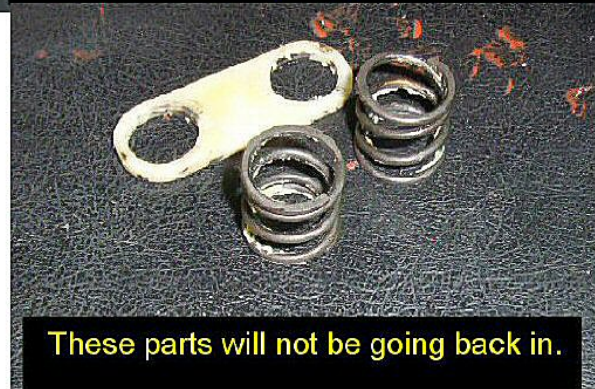
These parts will not be going back in.