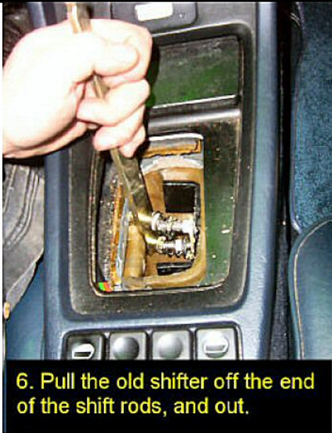
6. Pull the old shifter off the end of the shift rods, and out.