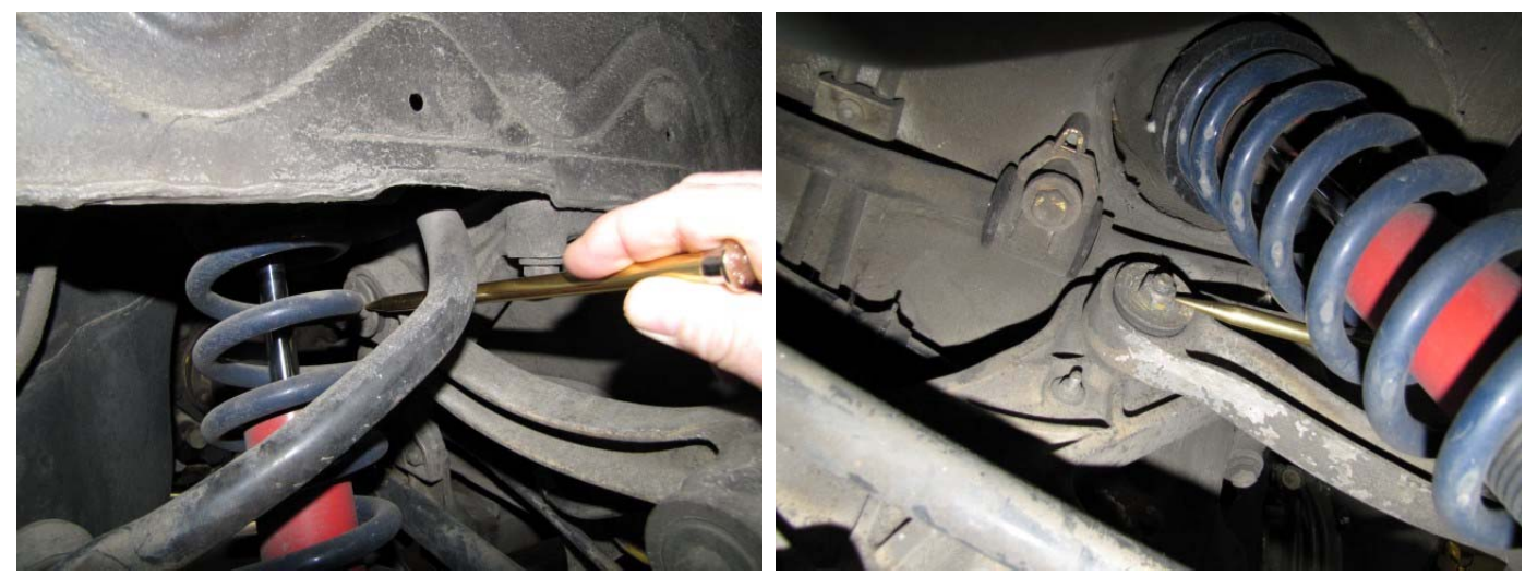
AS VIEWED FROM THE FENDER WELL

Both of these pictures show the same inner mounting nut.