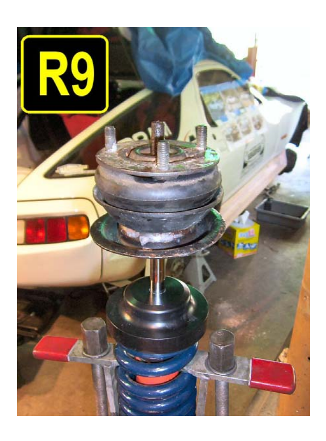
This shock & spring assembly is done and ready to re-install in your car.