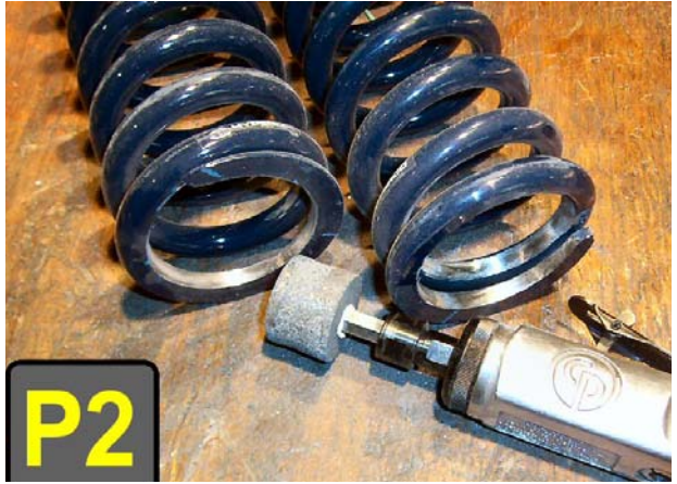
Picture P2 is to remind you to that your finished grind should be with a fine stone so as to leave no cuts or stress risers at the bottom of the spring.