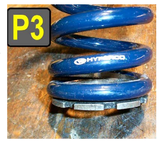
Picture P3 shows the ride/height adjustment nut comfortably seated inside the coil spring and ready for installation.