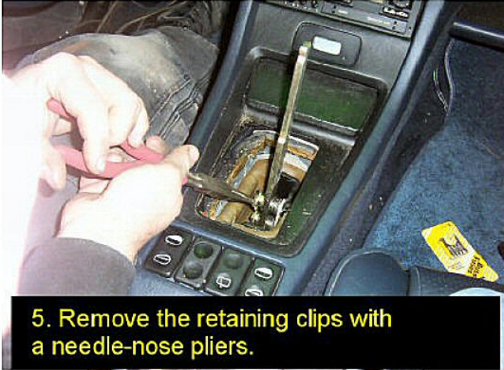
5. Remove the retaining clips with a needle-nose pliers.