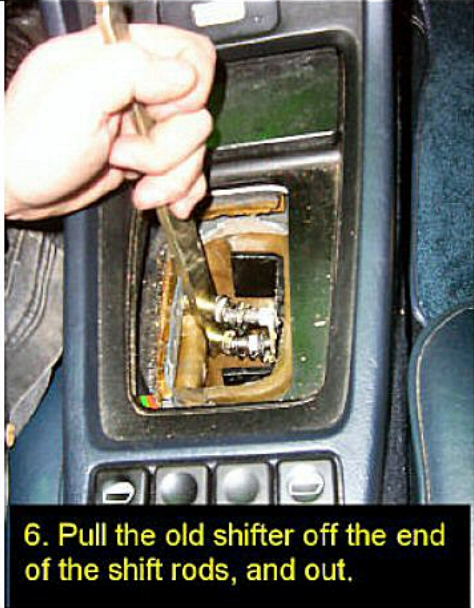
6. Pull the old shifter off the end of the shift rods, and out.