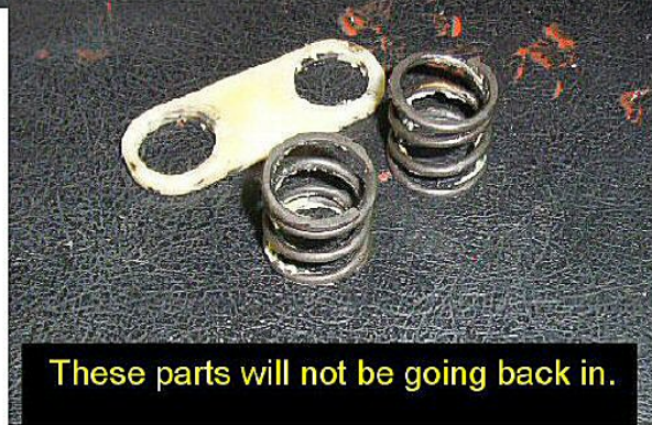
These parts will not be going back in.