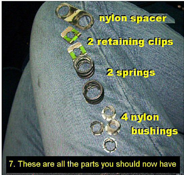
7. These are all the parts you should now have