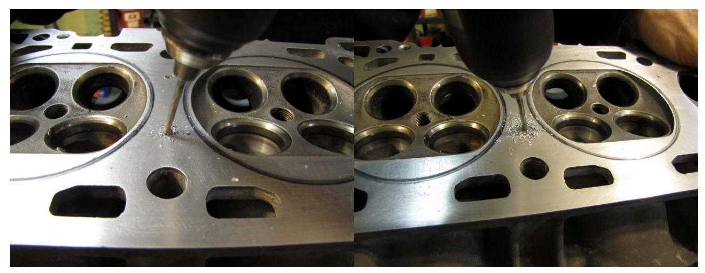
This is how it should look after Step 3 >